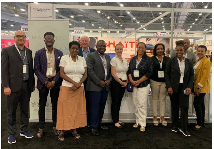
SMES from Haiti at COSMOPROF Trade Show in Las Vegas, U.S

The five-day training session was held from July 17 to 21, 2023 in the Kingdom of Morocco in Casablanca. The training was conducted in Classical Arabic, with an additional effort made to adapt explanations to four different local and regional Arabic dialects, whenever possible. This was done to ensure that the 35 female participants who came from varying educational and cultural backgrounds (26 from Morocco, two from Bahrain, two from Mauritania, two from Egypt, one from Tunisia, and two from the Kingdom of Saudi Arabia) could benefit from the material. After the event, attendees decided to form a federation that would continue the positive energy of the training. They aim to use it as a catalyst for prosperity, stability, and women's empowerment through exports.