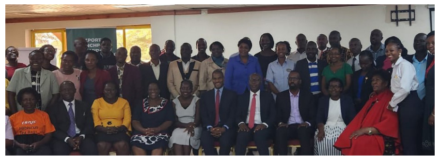
Export Launchpad Uganda - Certificate Ceremony in Kampala

A certificate ceremony was held in Kampala, Uganda in recognition of the successful completion of the export readiness training under the Export Launchpad Uganda program. Export Launchpad Uganda is a joint initiative of the International Islamic Trade Finance Corporation (ITFC), Trade Development Fund, and Global Affairs Canada through its Women in Trade for Inclusive and Sustainable Growth (WITISG) project, implemented by TFO Canada in collaboration with the Uganda Export Promotion Board.