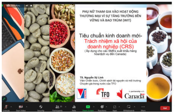
Processed food export readiness training for SMEs in Vietnam