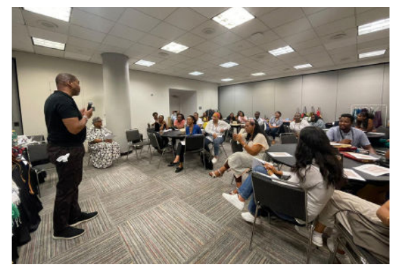
Info-session for SMEs from Ethiopia and Lesotho during the Market Familiarization Tour in New York

Under the SMO-LUME Project, funded by the Government of Canada, TFO Canada in collaboration with the Ministry of Industry (Mol), Entrepreneurship Development Institute (EDI) and Oromia Chamber of Commerce and Sectoral Association from Ethiopia, and the Lesotho Chamber of Commerce and Industry, Lesotho National Development Corporation and Basotho Enterprises Development Corporation of Lesotho organized a market familiarization tour for 14 women-led and one man-led small and medium-sized enterprises engaged in the textiles, crafts, and leather-fashion accessories sectors. Under the guidance and counseling of experts from Aid to Artisans, the delegation visited <a href="New York NOW">New York NOW</a> and <a href="ShoppeObject">ShoppeObject</a> trade shows, as well as a series of retail stores and facilities.