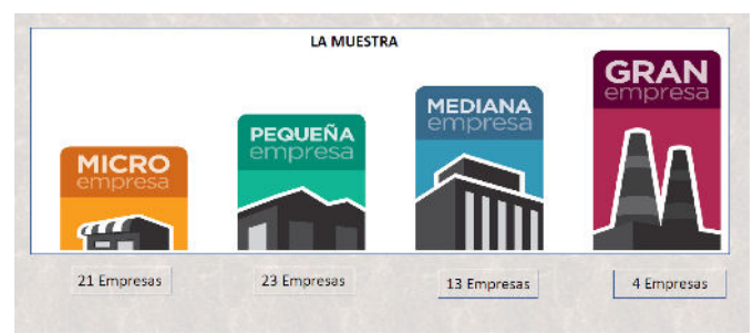
Guatemala Export Association Gender Assessment survey participants

In Guatemala, a gender assessment survey was launched by the Guatemala Export Association (Agexport) as part of their Gender and Social Inclusion (GESI) Action Plan. An analysis of the results provided a description of the level of women's participation and leadership in Agexport's member companies. The report emphasized the importance of continuing to identify and raise awareness of the challenges faced by women in trade.