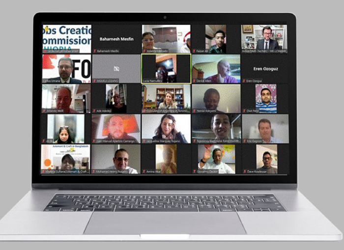
Webinar: Essentials to starting an import-export business with Canada

es - NY NOW under the sessions on Introducing TFO Canada Online Services 2022 in English, French and Spanish.