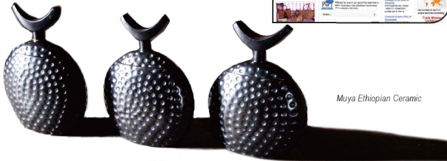
Muya Ethiopian Ceramic